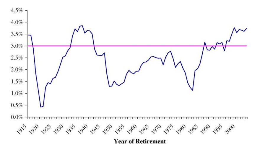
Fig. 2. Simulated internal rate of return for U.S. historical returns adjusted for historical medians.

When historical U.S. returns are used for the analysis, the baseline life-cycle portfolio (Table 2, columns 1 and 2) is at best disappointing, at least compared with the rhetoric that has characterized much of the advocacy for the personal accounts. The real internal rate of return is only 3.4% a year, only slightly above the offset rate of 3%. While the median final portfolio value (after offset)